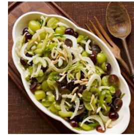
Fennel and Grape Salad